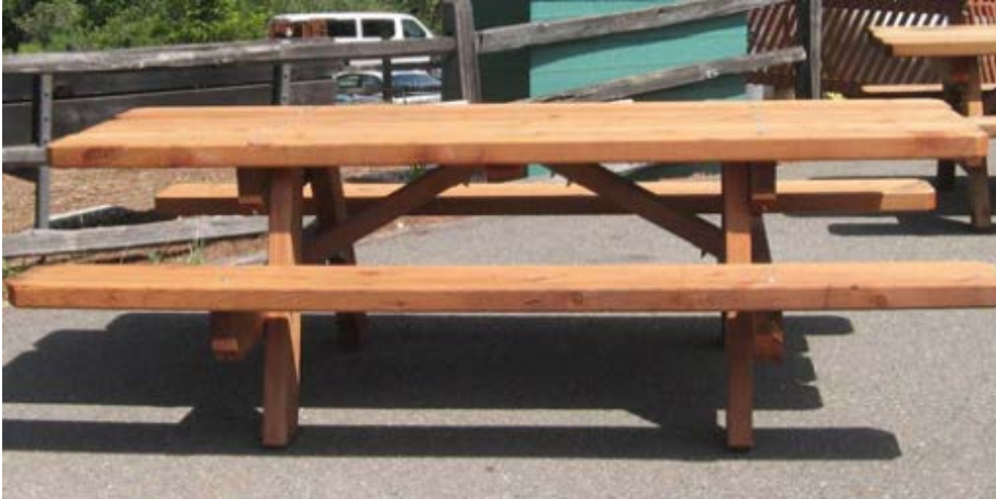
2 Eight Foot redwood ADA compliant picnic table.