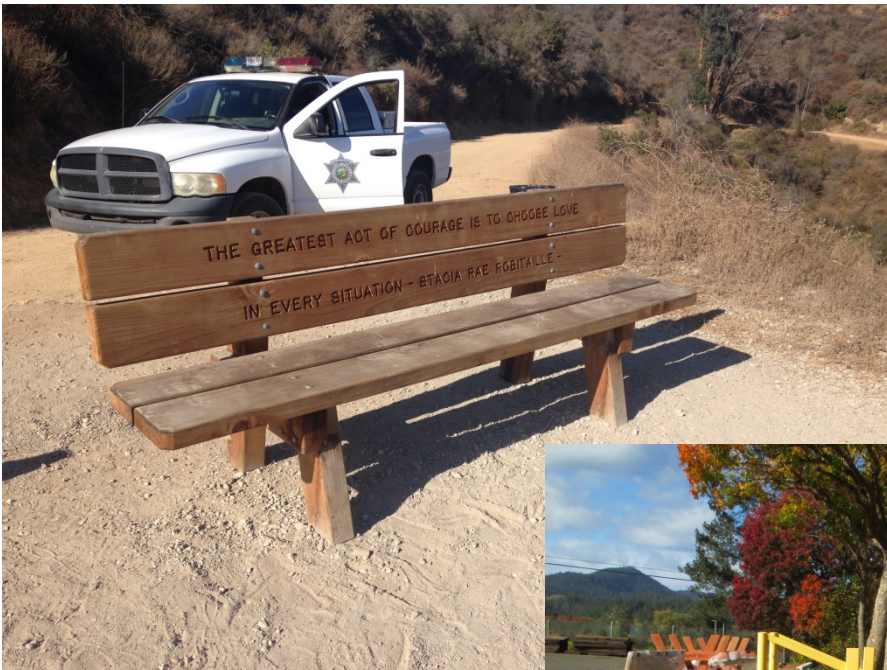
1 Eight foot redwood ADA compliant bench.